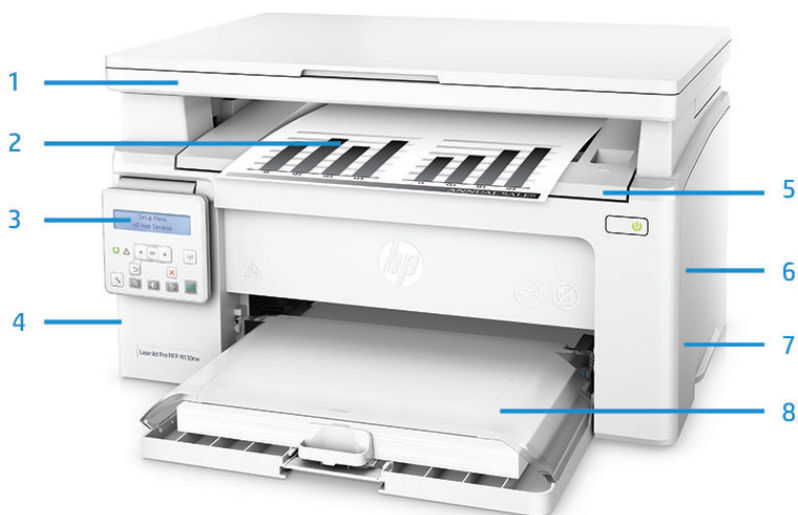
HP LaserJet Pro MFP M130nw