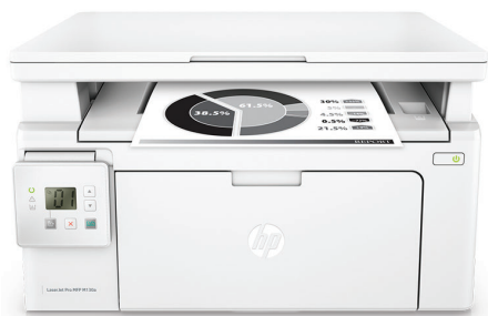
HP LaserJet Pro MFP M130a

Print professional documents from a range of mobile devices, 1 plus scan and copy, and help save energy with a wireless MFP designed for efficiency.