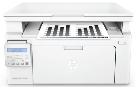
HP LaserJet Pro MFP M130nw